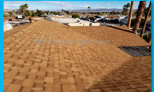
ASPHALT SHINGLE & TILE