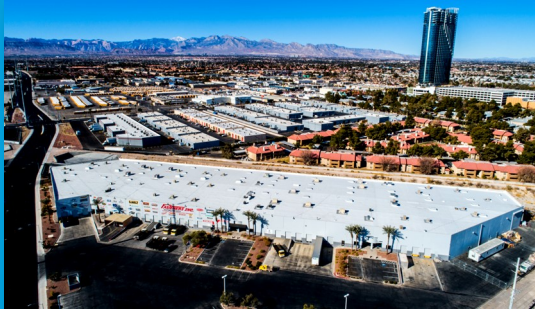
TPO / PVC SINGLE PLY ROOFING

COMMERCIAL • RESIDENTIAL • MULTI-FAMILY • HOA