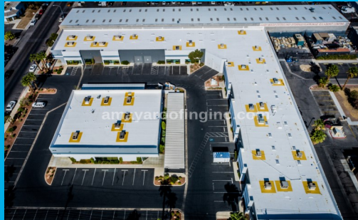
ROOF COATING RESTORATION