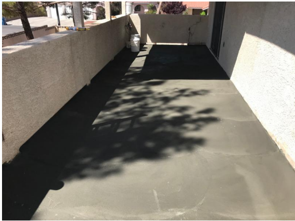
New Base Cement Installed