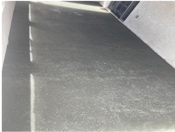
New Texture Added To Deck Surface