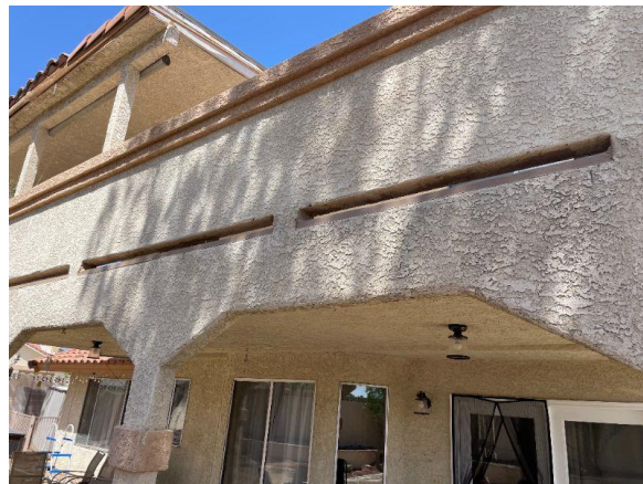
Drip Edge Flashing Coated To Match

Main Line: (855) 325-ROOF (325-7663) 5016 Schuster Street, Suite 100 • Las Vegas, NV 89118 • Ph: (702) 420-2419 • Fx: (888) 558-3064 NV State C15 License No. 81903 / Monetary Limit: $4,300,000 NV State B License No. 81904 / Monetary Limit: $8,000,000 www.amayarooftinginc.com