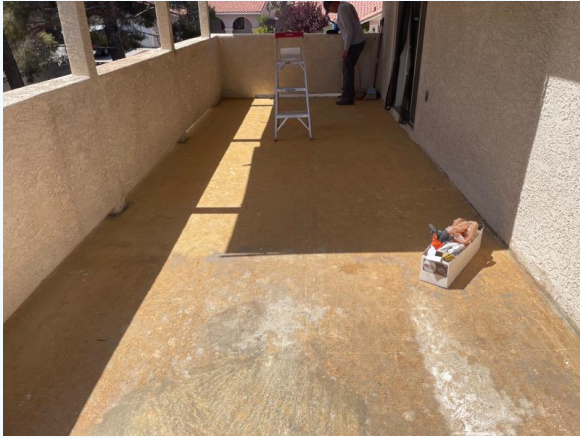
Existing Deck Condition