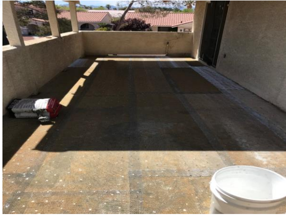
New Metal Lath Installed